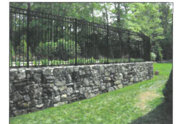
BLACK METAL RAILING WITH STONE COLUMNS

BILTMORE FOREST COUNTRY CLUB, INC. D.B. 1780 Pg. 102