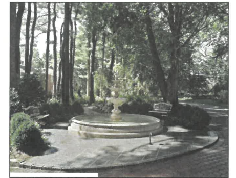
FOUNTAIN, BLUESTONE WALK BENCHES, CLASSIC CONTAINERS