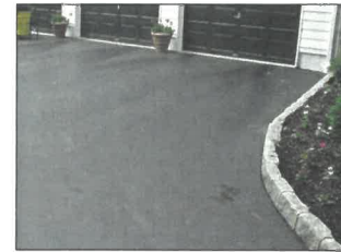
CRAB ORCHARD CURB STONE