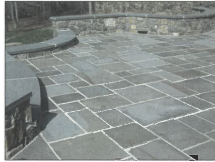
BLUESTONE TERRACE AND WALKS