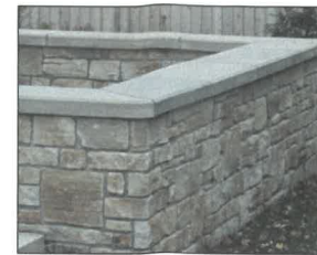
STONE VENEER WALLS BLUESTONE CAP